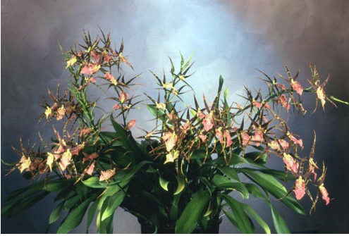
Mtssa. Shelob 'Tolkien' AM/AOS