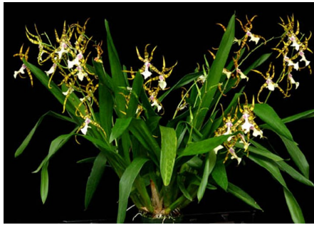
Exotic Orchid 'Copius' Patent Process Initiated Miltassia Golden Spider 'Copius'