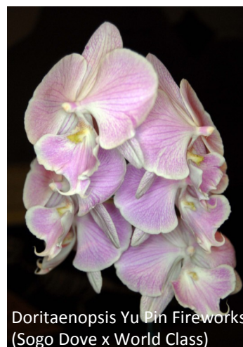
Doritaenopsis Yu Pin Fireworks (Sogo Dove x World Class)