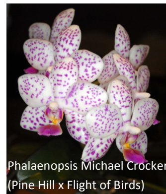
Phalaenopsis Michael Crocker (Pine Hill x Flight of Birds)