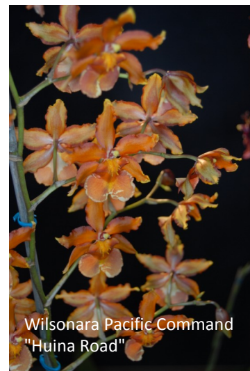
Wilsonara Pacific Command "Huina Road"