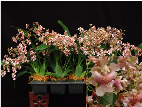
Onc. Pacific Sunrise 'Hakalau'