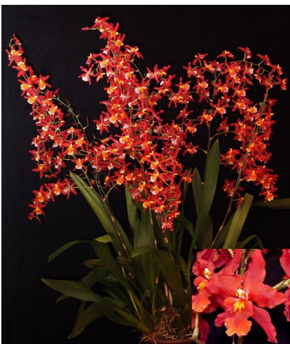
Exotic Orchid 'Fireside Fever' Patent Process Initiated Wils.-Pacific-Panache-'Fireside-Fever