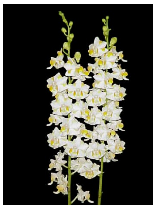
Dor. Champorensis (white)