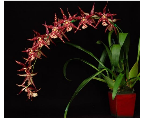
Sand. Black Star 'Pacific Red Star'