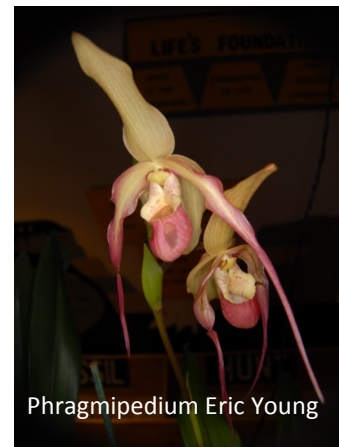
Phragmipedium Eric Young