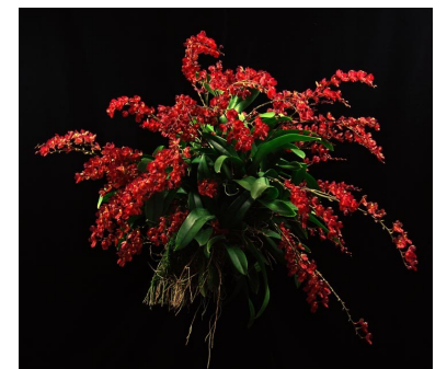
Hwra. Lava Burst 'Puanani' AM/AOS